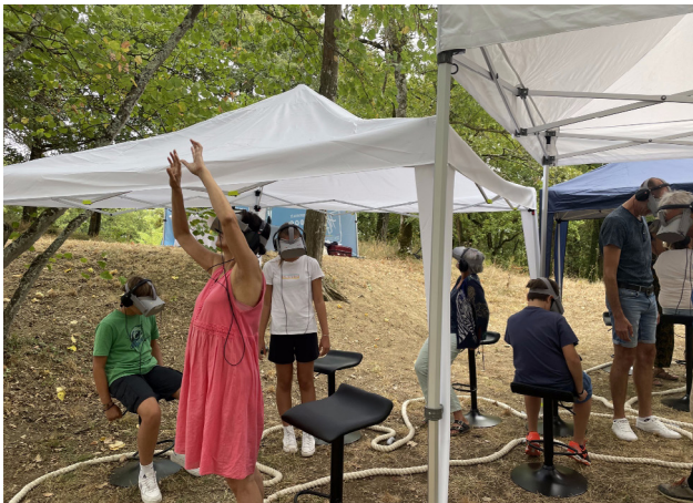
Note d'été Festival, Laréole Castle (FR)