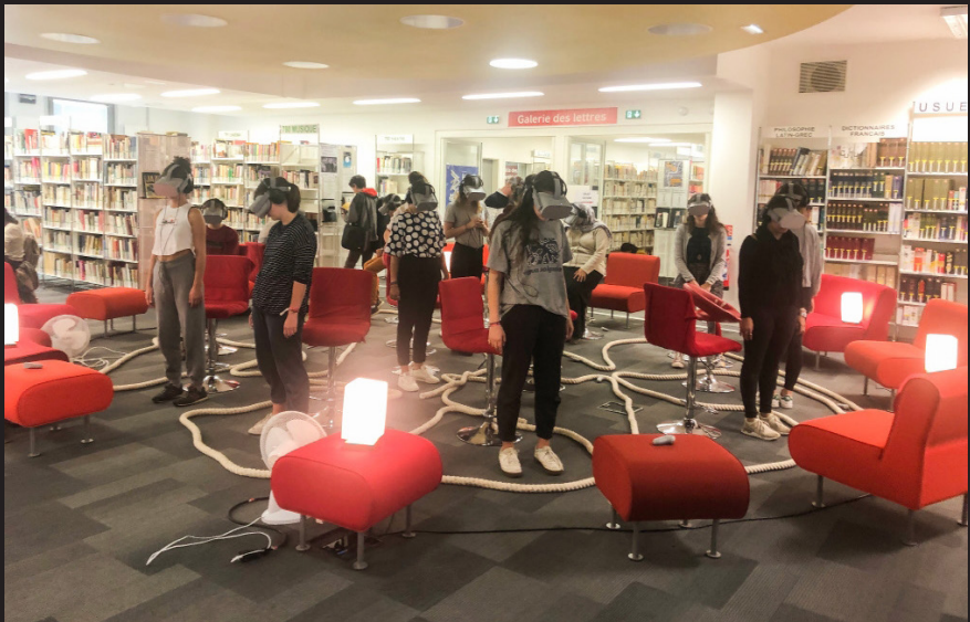
University library, Université Toulouse II Jean Jaurès