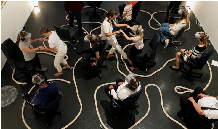
Kerava library, Finland