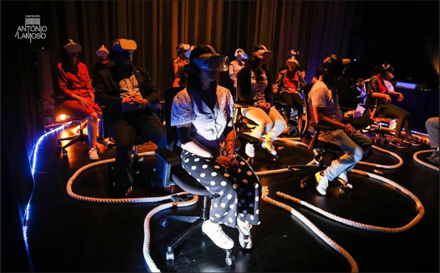
Imaginarius | Festival Internacional de Teatro de Rua (PT)