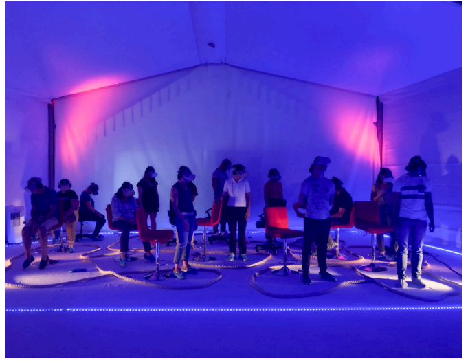
CIAM | Festival Jours et nuits de cirques