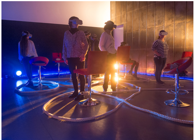
CircoTech | La Grainerie