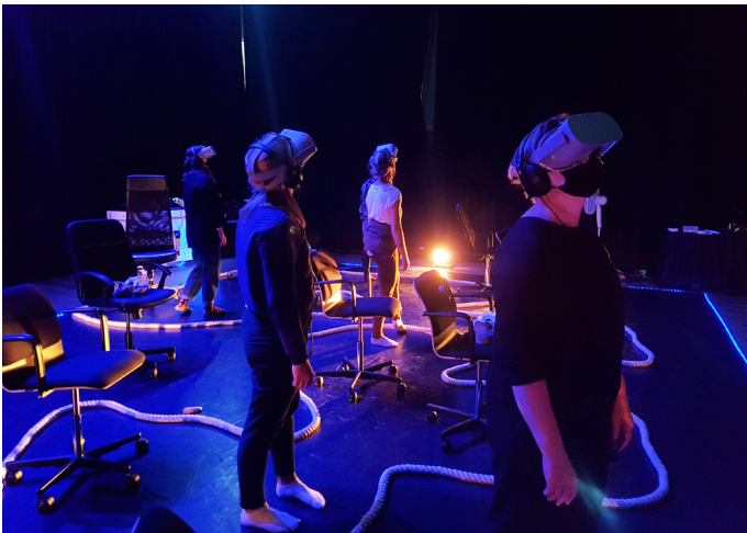
International Biennial of Circus Arts