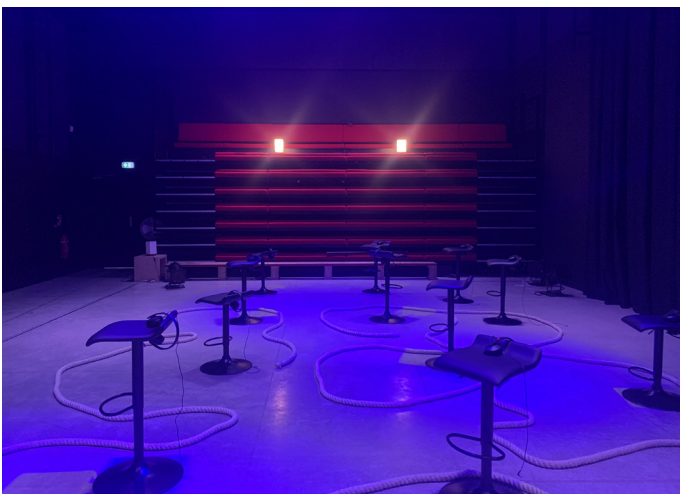
Ateliers Médicis | Clichy-sous-bois