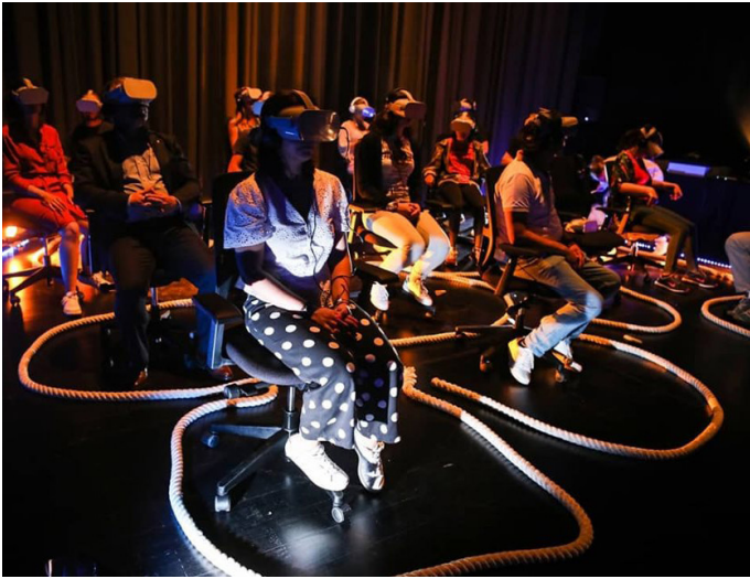
Imaginarium | Festival Internacional de Teatro de Rua (PT)